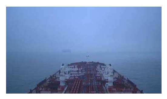
Human eye view