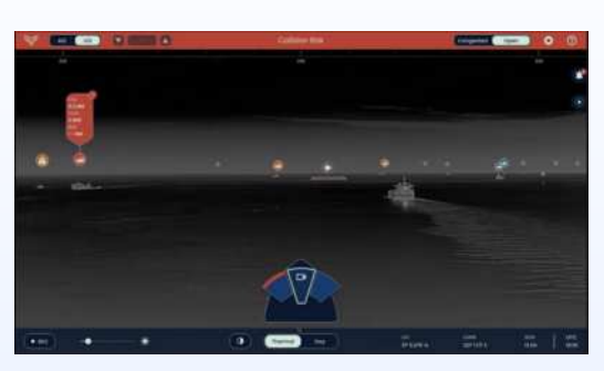
Orca Al view