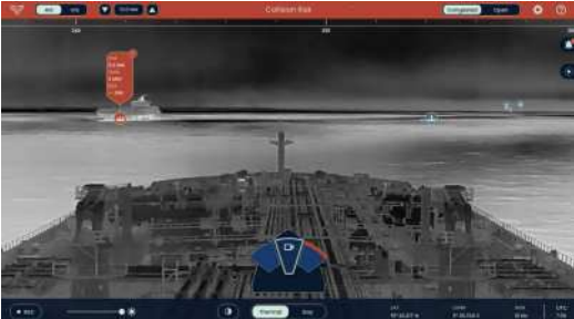
Orca Al view